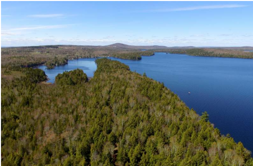
CHADWICK POINT ON EAST GRAND LAKE 28± ACRES IN WESTON, MAINE